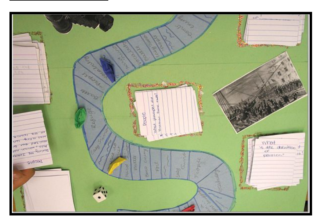
Game board sample # 2