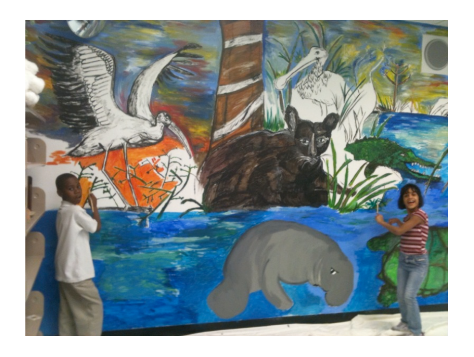
Teachers get involved and contribute to this Masterpiece!!!