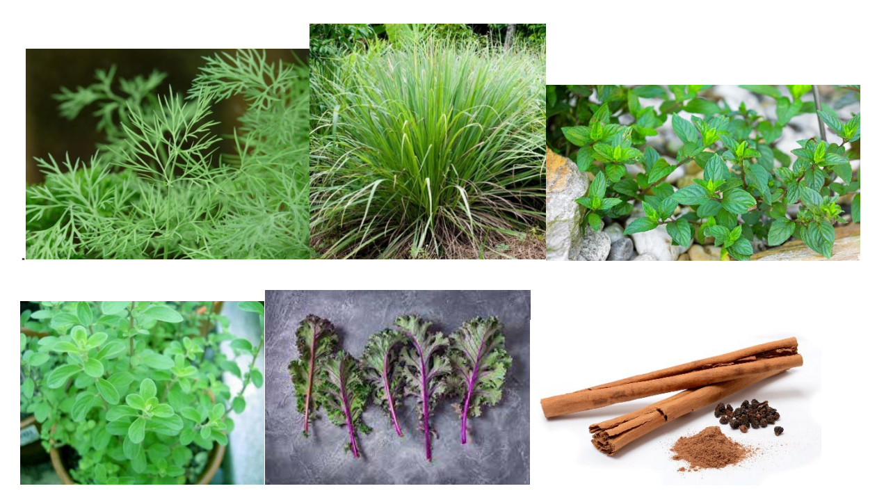
1.Dill 2. Lemongrass 3.Mint 4.Oregano 5.Kali 6.Cinnamon

Once you have added the pulp, swish it with your hand to get any that may have settled, and then slip your mold and deckle into the pulp. Hold the mold and deckle together, ensuring that the mold (the part with the screen) has the screen facing up. Pull the mold and deckle straight up (moving the mold and deckle together back and forth to swish around the pulp and water a bit to even it out as you pull). Stop moving the mold and deckle once most of the water drains out. In this session students will focus on bark, branches and leaves