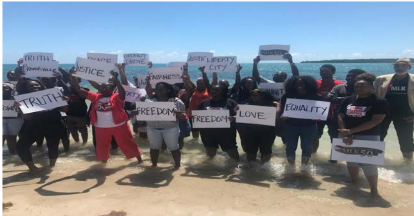
HISTORIC VIRGINIA KEY BEACH PARK