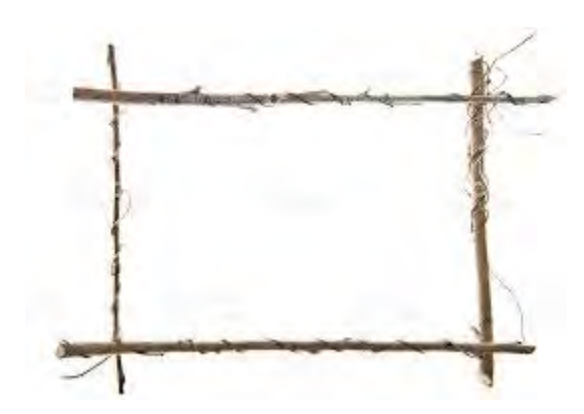
Step 2: Assemble Two Side Frames

Create two rectangular frames, one for each side. For each frame, lay two 7-foot-long sticks parallel. attach one stick 5 inches from the tops of the two poles, another 10 inches from the bottoms, and the third in the middle. Next, nail two 60-inch-long sticks in an X shape on the bottom half for stability.