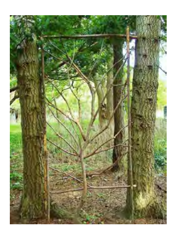
Step 3: Add Decorative Branches

Use some of the decorative branches to create an attractive pattern on each side frame. The branches add an aesthetic element and provide a trellis for vines to climb the arbor.