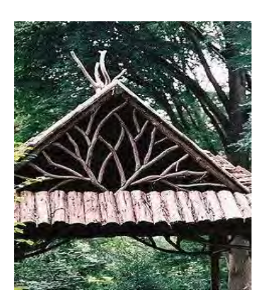
Step 5: Decorate the Top

Add decorative sticks to embellish the gables. Trim excess branches and bend/ cut any exposed nail tips.